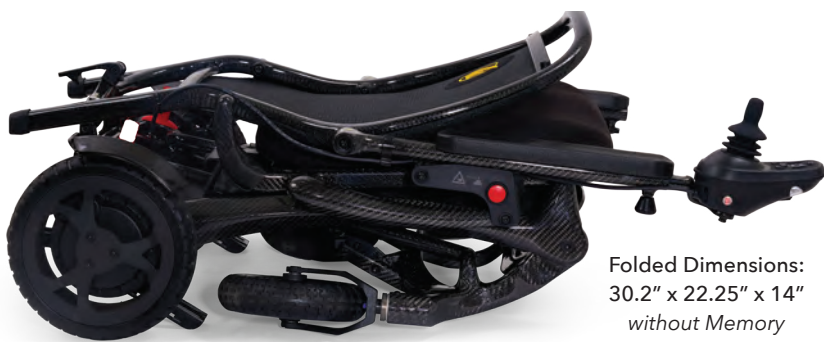
Folded Dimensions: 30.2" x 22.25" x 14" without Memory Foam Cushion

Lightweight carbon fiber construction, one-step folding and compact upright storage make the Cricket™ an easy companion for travel, transport and everyday adventures.